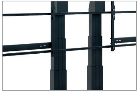
Motorised height adjustment - 700 mm travel way

In addition to the pre-configured systems, HAGOR offers customised special solutions in the LED sector, which can be individualised with accessories such as loudspeakers, controls and so on to meet all requirements.