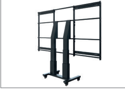
No fine adjustment necessary

mobile thanks to castors with lock-type brake